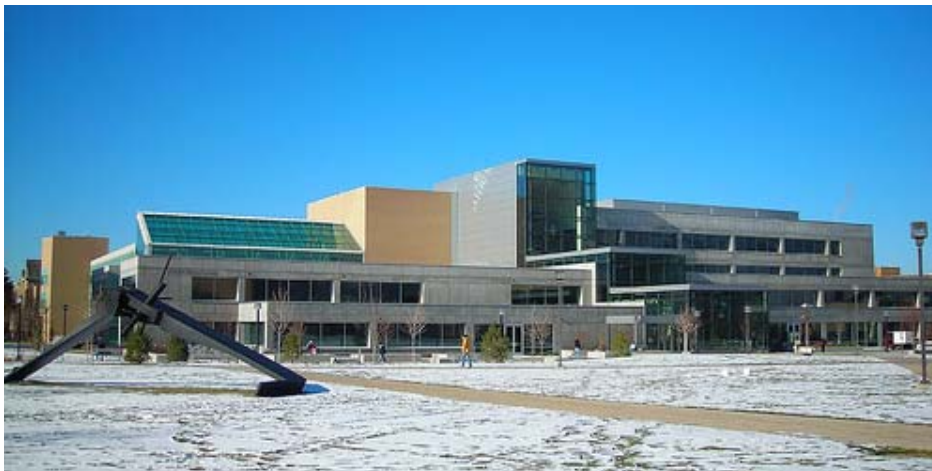
The Merrill-Cazier Library

For example, Special Collections has a unique assembly of cowboy poetry. Why